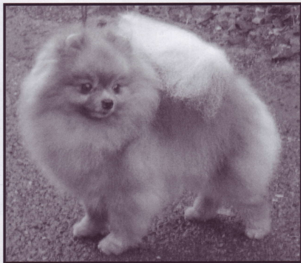
Multi CH SWinner - 03 Sunline Lady In Red