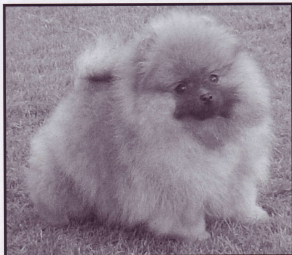
Black Orange's Moon Shadow