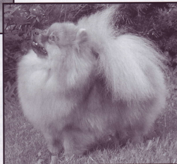
Black Orange's Not For Sale 14 months