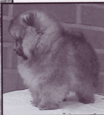
Black Orange's King Of The Pom 12 weeks