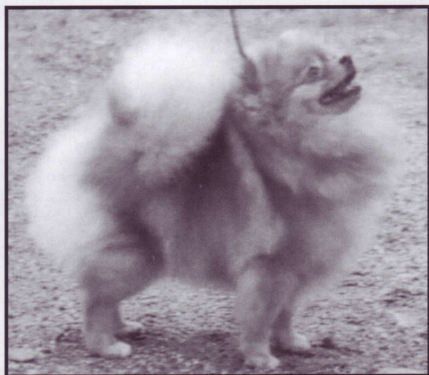
Multi CH Yllinkyllin Dirlandaa