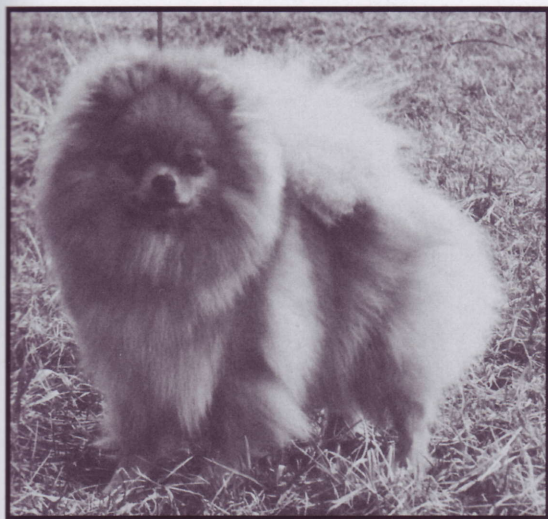
FIN CH Black Orange's Suprising Sun