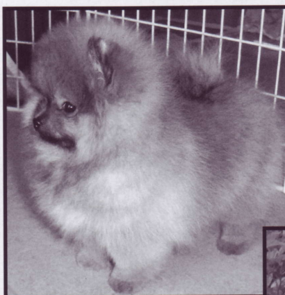
Black Orange's Not For Sale 9 weeks