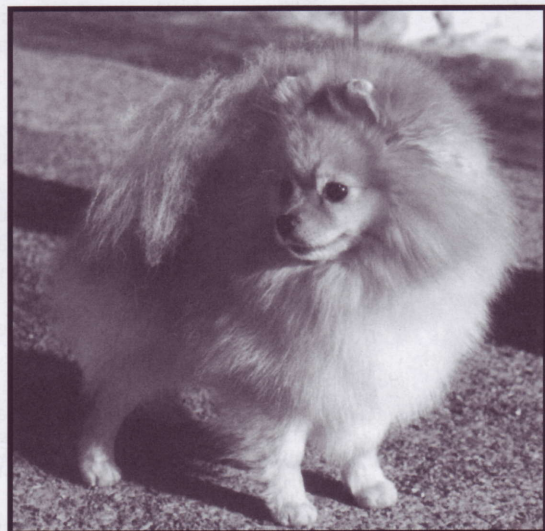
FIN EST CH Baltic Winner -00 Black Orange's Midnight Star