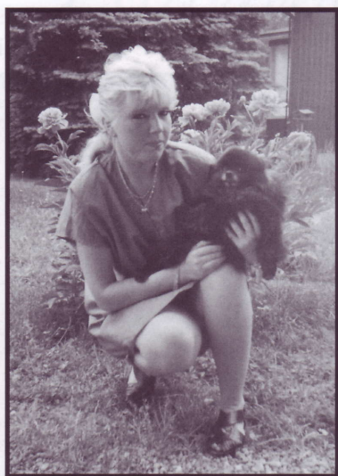
Me and my first Pom Fin CH Black Bessie at Tiny Dolls

heart. The visit ended with me going home with Bessie and I was very much attached to the dog just like everyone else became when they met her.