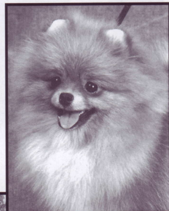
Black Orange's Royal Straight Flush, Grace BIS 3 puppies