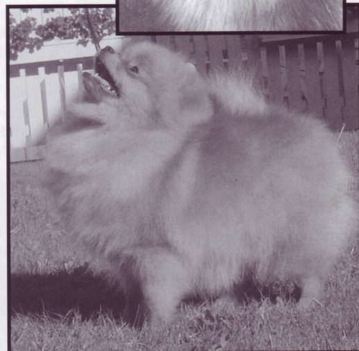
Black Orange's Royal Straight Flush 6.5 months old