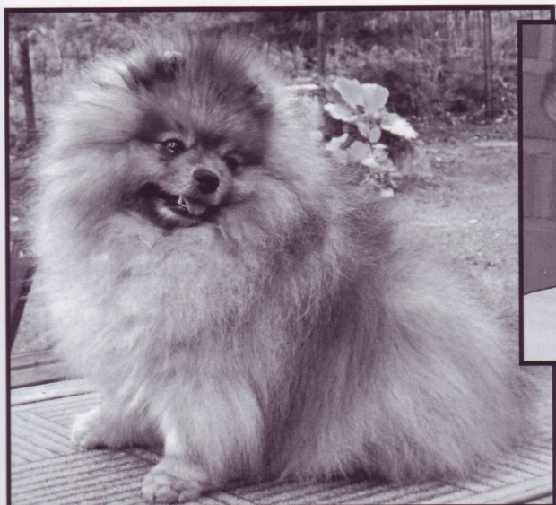
Black Orange's King Of The Poms sired by INT Multi CH Multi Winner Toybox For Havens Sake