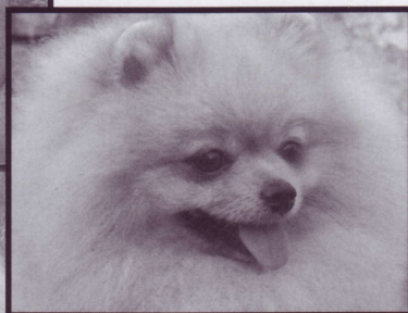
S CH Black Orange's Wave Of The Year 18 month old