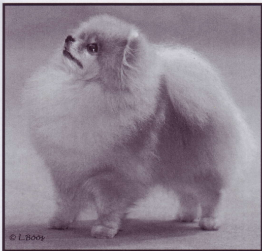
WoodroseMakingWaves BIG 5 under judge Per - Erik Wallin, Sweden